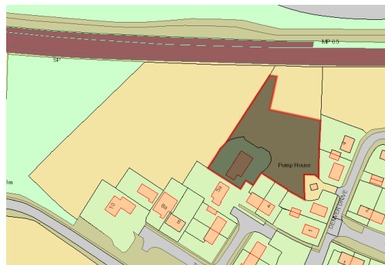
Figure 3: Extract from DBC public access system mapping (boundary for applications 16/00500/FUL and 19/00183FUL)