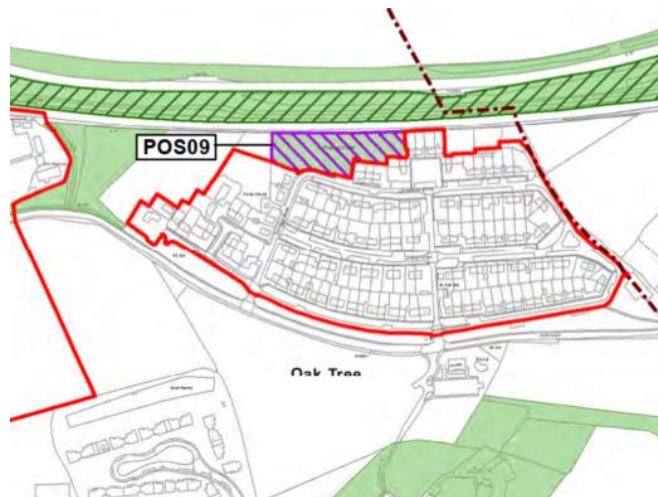
Figure 2: Extract from submission neighbourhood plan policies map showing proposed Oak Tree settlement boundary